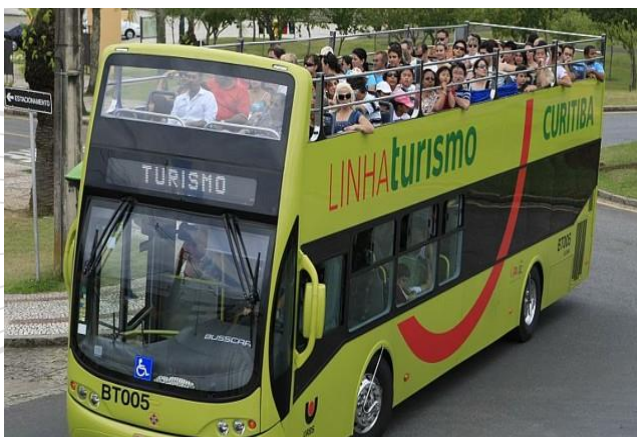
Panoramic Bus in Curitiba