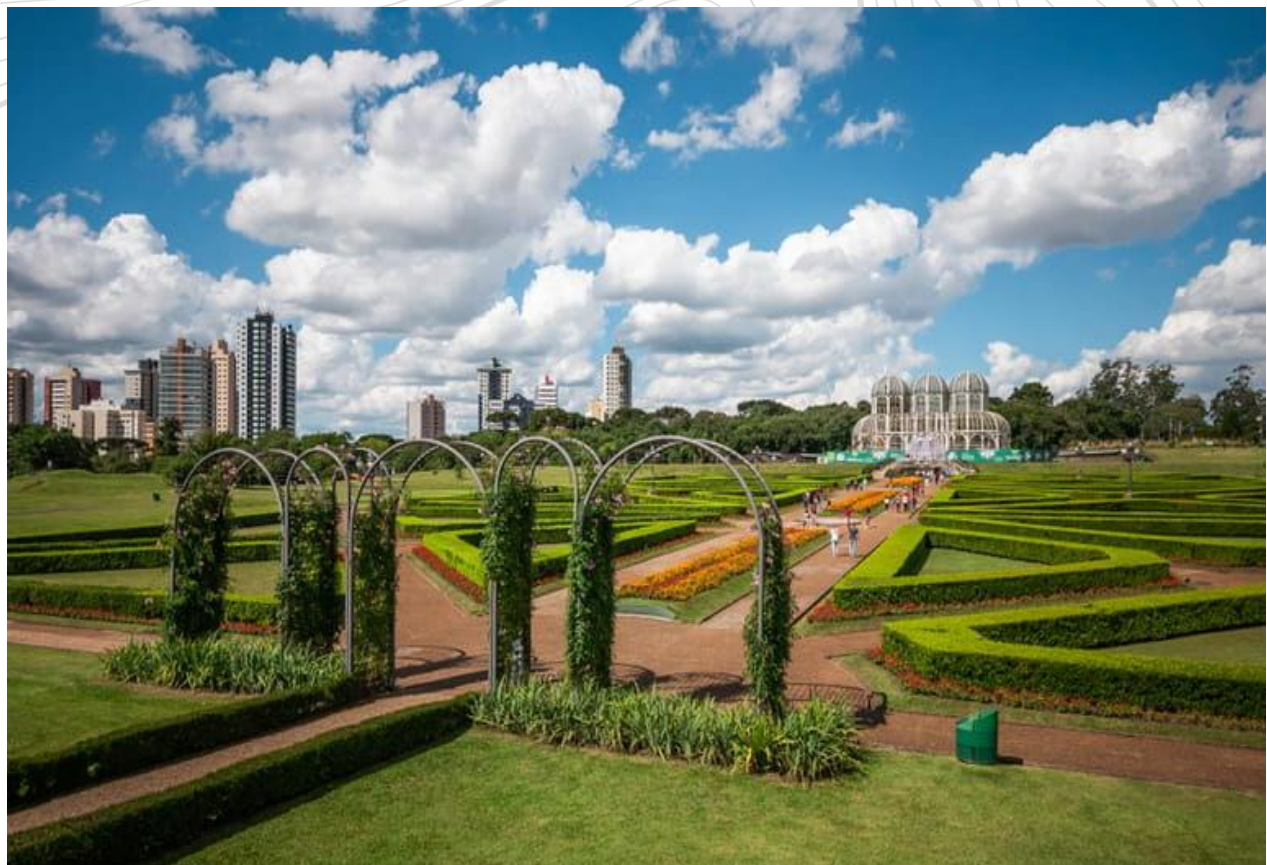
Botanic Garden – Curitiba – PR