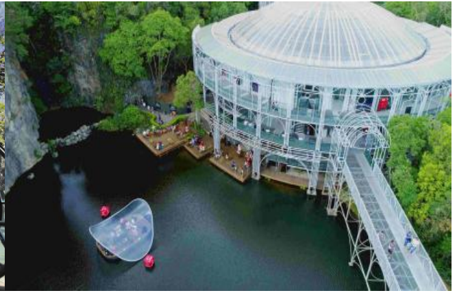
The Wire Opera– Curitiba – PR