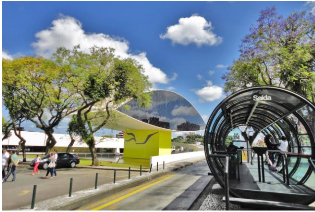
The “Eye” Museum – Curitiba – PR